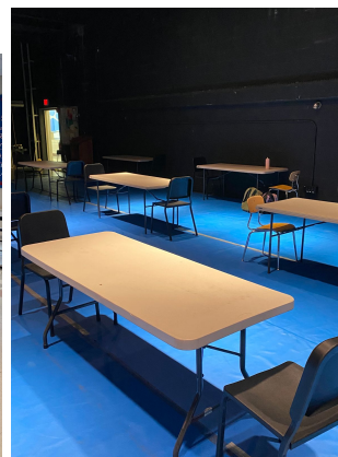
Morning arrival and socially distanced cafeteria seating